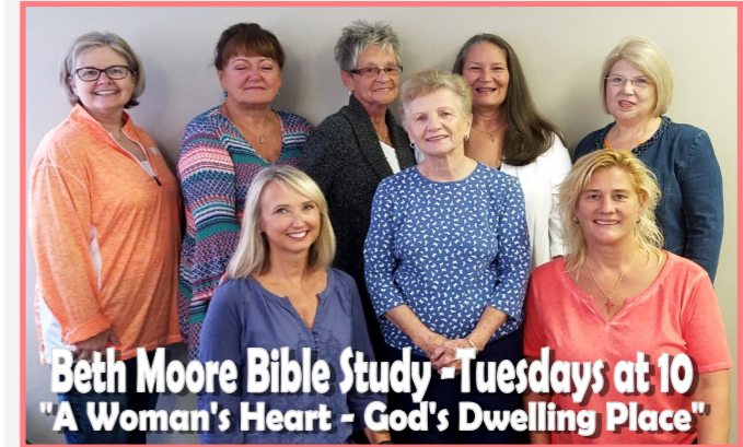
Beth Moore Bible Study - Tuesdays at 10 "A Woman's Heart - God's Dwelling Place"