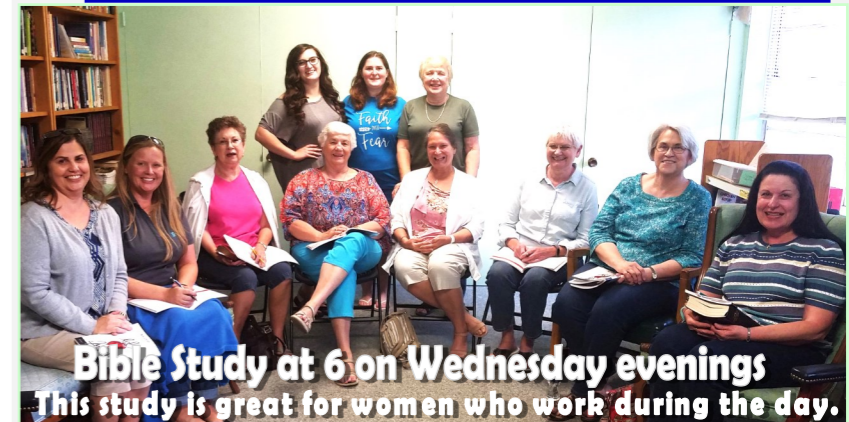
Bible Study at 6 on Wednesday evenings This study is great for women who work during the day.